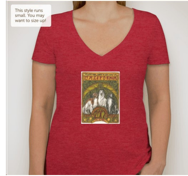
Vintage Red $20 (This item runs small order 1 size larger)