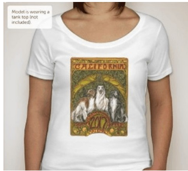
Gildan, White Scoop $20