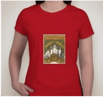
Jerzees, Red $20