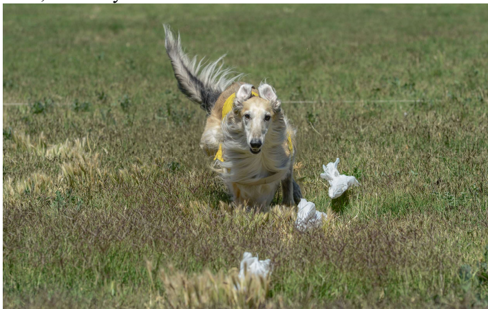
Dior, Photo by Clark Kranz