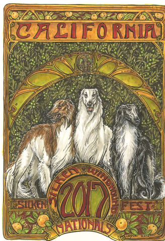
SilkenFest Poster (11 x 14.5)