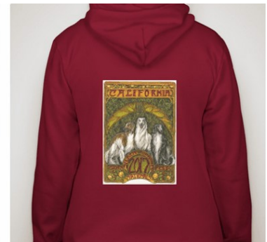
Gildan, Ladies Zip Hoodie in Vintage Red $40