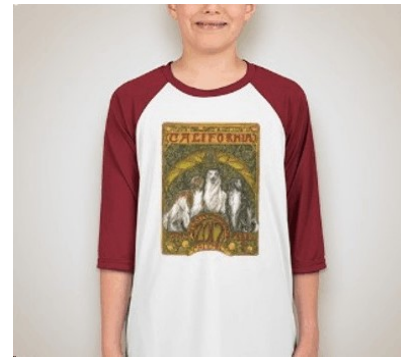
Child's Raglan, White & Cardinal $20 Also available in Adult sizes $25