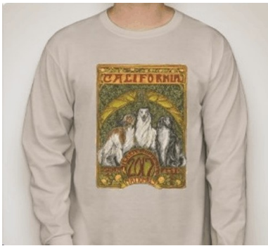
Jerzees, Long Sleeve in Sandstone $25