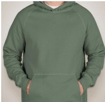
Hanes, Vintage Green Pull Over Hoodie $40