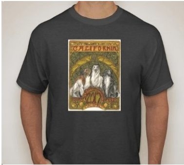
Hanes 50/50, Available in Smoky Grey, Maroon, Light Blue & Stone Washed Green $20