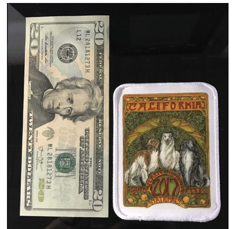
Sublimated Patch (4 x 3)